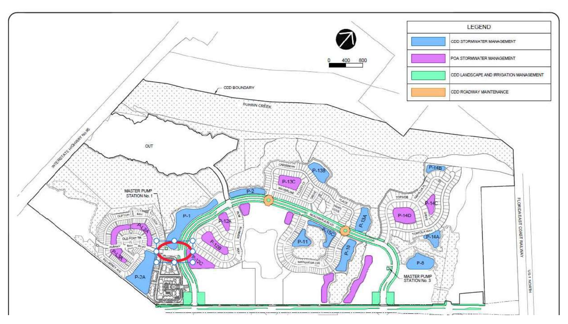
Exhibit F: Landscape and Pond Maintenance Map