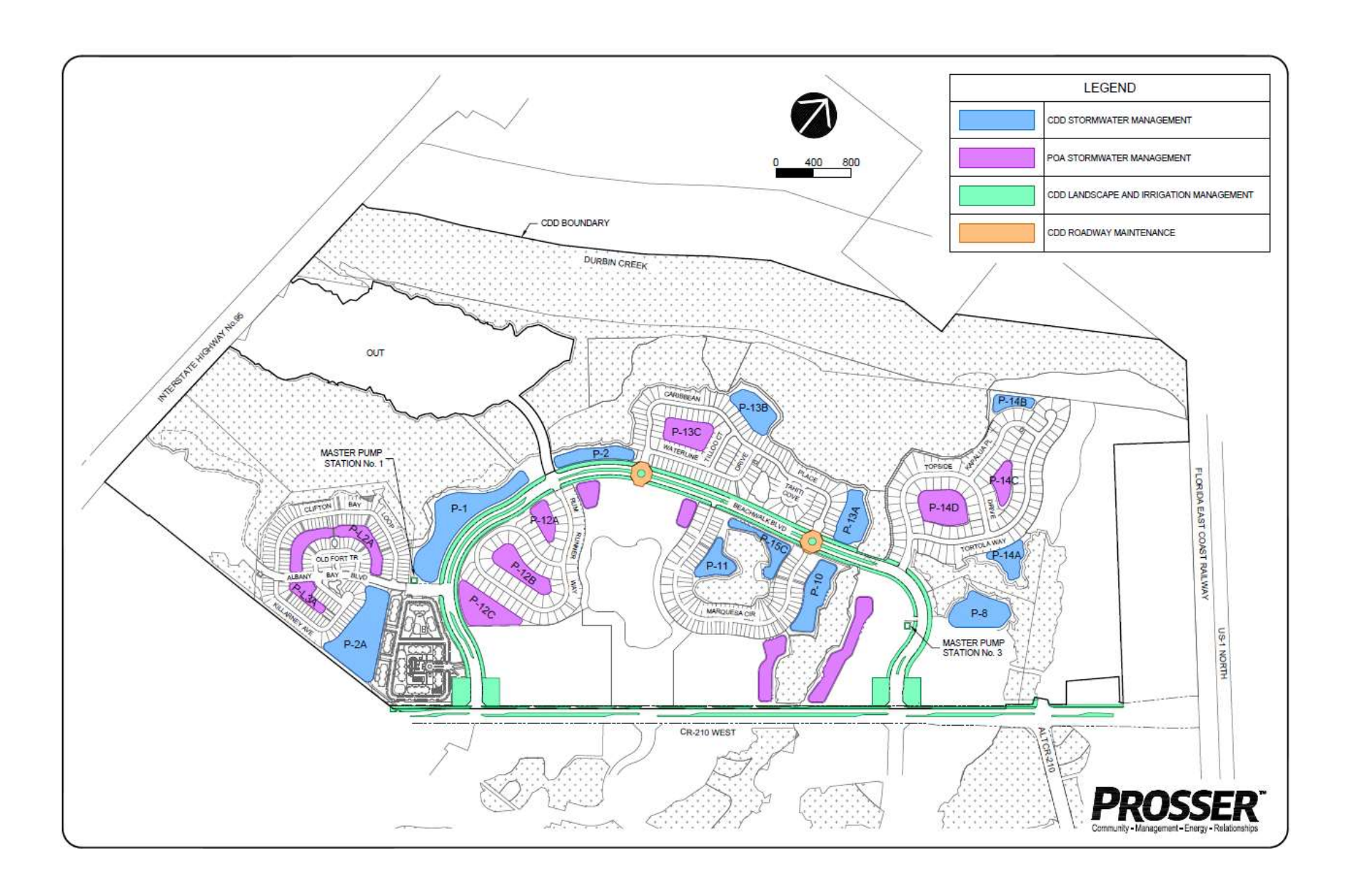
Exhibit F: Landscape and Pond Maintenance Map